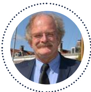
Roel Sluiter, Mayor of Harlingen